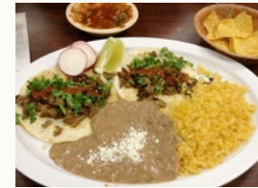
Two Taco Combo

Family owned business, with authentic Mexican Food, and great customer service. You can order by phone for pick up or to go! We are grateful to have Taqueria El Coral as our main food provided for this year's event!