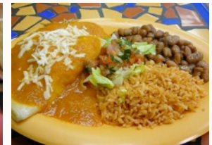
Chicken Enchiladas Plate

PINK ELEPHANT DONATED BAKERY $60.00 (408) 923-3436