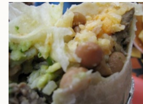
Inside the Burrito

With a huge collection of sauces and a salsa bar, fresh ingredients, and food from scratch what's not to like about this taqueria? This year they graciously donated salad for Music That Inspires!